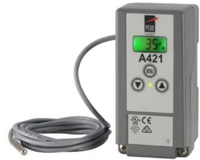
A421 Series Electronic Temperature Control